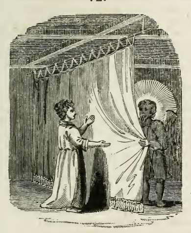
PSALM XLII. 2.

When shall I come and appear before God? What is my soul the better to be tin'd With holy fire? what boots it to be coin'd With Heav'n's own stamp? what 'vantage can there be