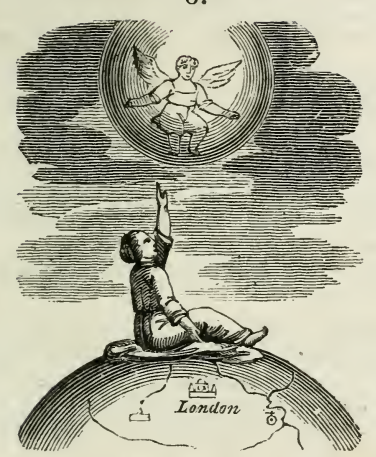
PSALM LXXIII. 25.

Whom have I in heaven but thee? and there is none upon earth that I desire beside thee.