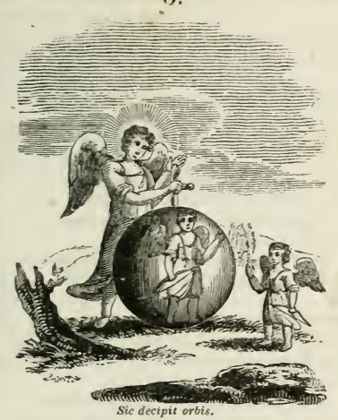
JOB xv. 31.