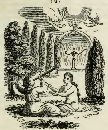
DEUT, XXXII, 29.

O that men were wise, that they understood this, that they would consider their latter end!