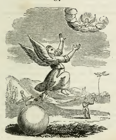
PHILIPPIANS I. 23.

I am in a strait betwixt two, having a desire to depart, and to be with Christ.