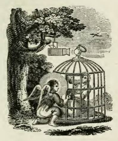
PSALM CXLII. 7.

Bring my soul out of prison, that I may praise thy