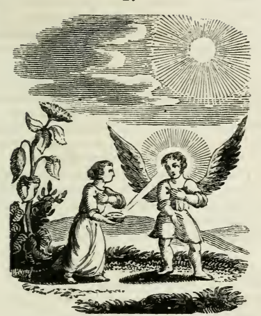
CANTICLES VII. 10.

I am my beloved's, and his desire is towards me.