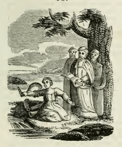
PSALM CXXXVII. 4.

How shall we sing the Lord's song in a strange land? U_{ ext{RGE}} me no more: this airy mirth belongs