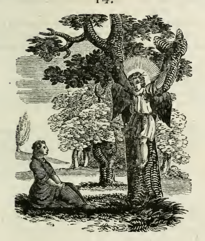
CANTICLES II. 3.

I sat down under his shadow with great delight, and his fruit was sweet to my taste.