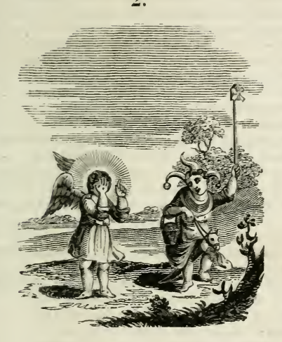
PSALM LXIX. 5.

O Lord, thou knowest my foolishness, and my sins are not hid from thee.