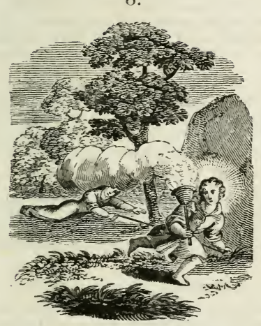
CANILLES 1. 0. 4.

Drawme; we will run after thee because of the savour of thy good ointments.