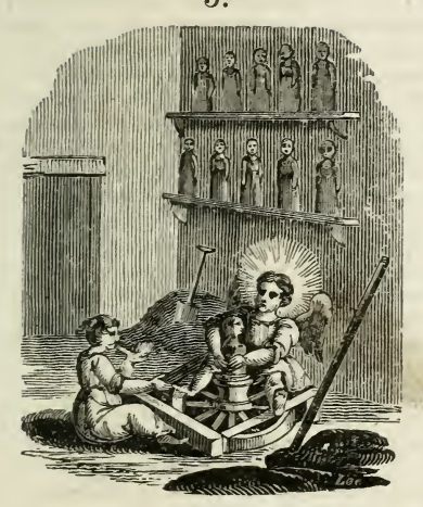
ЈОВ Х. 9.

Remember, I be seech thee, that thou hast made me as the clay; and wilt thou bring me into dust again?