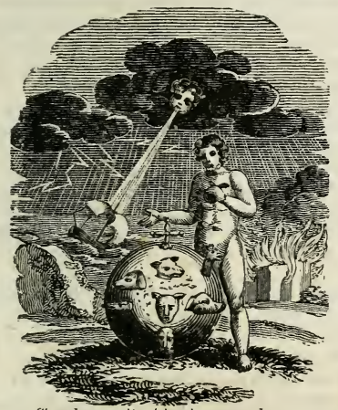
Sic malum cecuit unicium in omne malum.