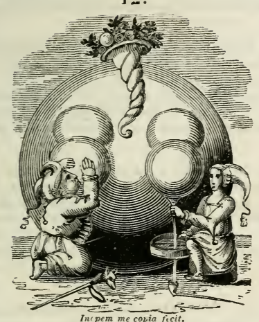
ISAIAH LXVI. 11.

Ye may suck, but not be satisfied with the breast of her consolution.