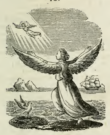
PSALM LV. 6.

O that I had wings like a dove, for then would I fly away, and be at rest!