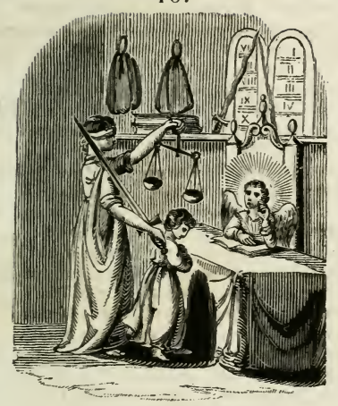
PSALM CXLIII. 9.

Enter not into judgment with thy servant; for in thy sight shall no man living be justified.