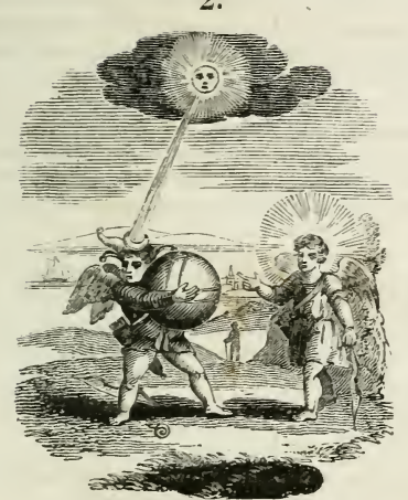
Donec tolum expleat ornem.