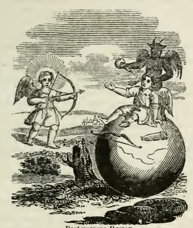
Post vulnera Damen.