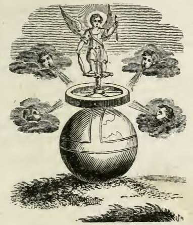
In cruce stat securus amor.

GALAT. VI. 14. God forbid that I should glory, save in the cross. Can nothing settle my uncertain breast, And fix my rambling love? Can my affections find out nothing best, But still and still remove? Has earth no mercy? Will no ark of rest Receive my restless dove?