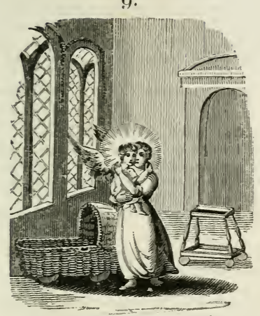
CANTICLES VIII. 1.

O that thou wert as my brother, that sucked the breasts of my mother! when I should find thee without, I would kiss thee.