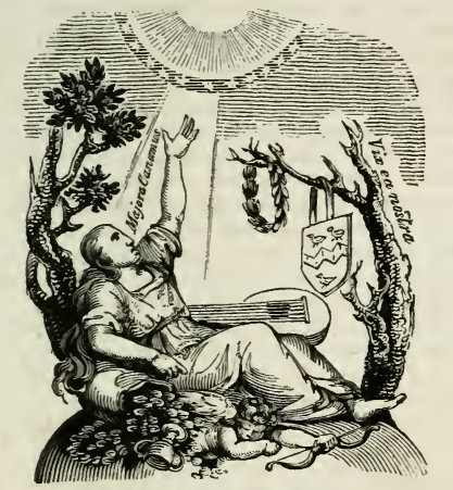
Dum Celum aspicio Solum despicio.