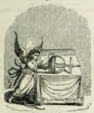
In cruce tuta quies.