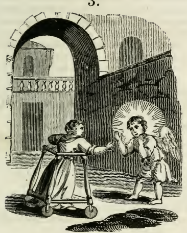
PSALM XVII. 5. Hold up my goings in thy paths, that my footsteps slip not.

Whene'en the old exchange of profit rings Her silver saints-bell of uncertain gains; My merchant-soul can stretch both legs and wings, How I can run, and take unwearied pains! The charms of profit are so strong, that I, Who wanted legs to go, find wings to fly.