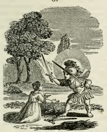
JOB VII. 20.

I have sinned: What shall I do unto thee, O thou Prescriver of men? why dost thou set me as a mark against thee?