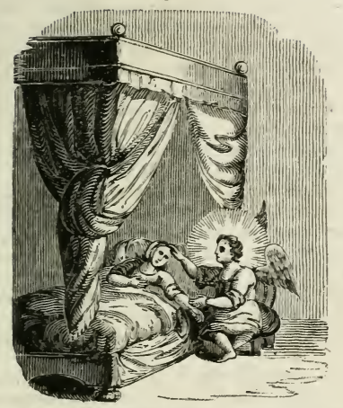
PSALM VI. 2. Have mercy, Lord, upon me, for I am weak; O Lord, heal me, for my bones are vexed.