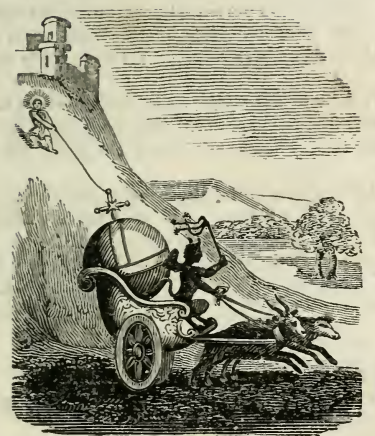
Mundus in exilium ruit.