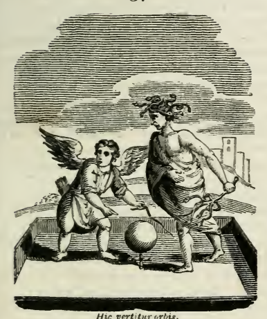
Hic vertitur orois.