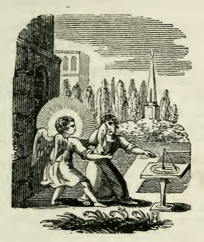
JOB x. 20.

Are not my days few? Cease then, and let me alone, that I may bewail myself a little.