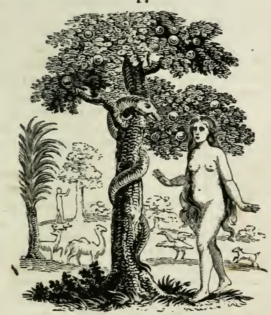
Totus mundus in maligno (maliligno) positus est.