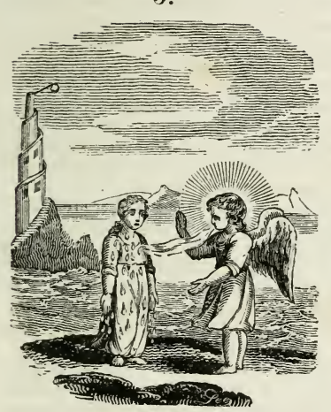
CANTICLES V. 6.

My soul melted whilst my beloved spake. Lond, has the feeble voice of flesh and blood The pow'r to work thine ears into a flood Of melted mercy? or the strength t' unlock The gates of Heav'n, and to dissolve a rock Of marble clouds into a morning show'r? Or hath the breath of whining dust the pow'r