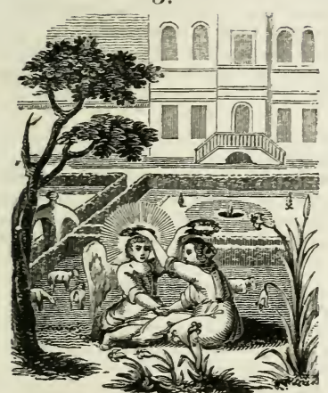
CANTICLES II. 16.

My beloved is mine, and I am his; he feedeth among