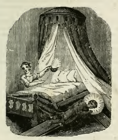
CANTICLES III. 1.

By night on my bed I sought him whom my soul loveth; I sought him, but I found him not.