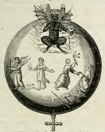
Debilitate fides Terras: Astraa reliquit.