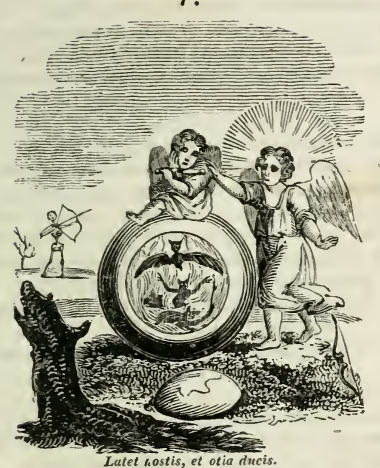
1 PETER V. 8.

Be sober, be vigilant; because your adversary the devil, as a roaring lion, walketh about, seeking whom he may devour.