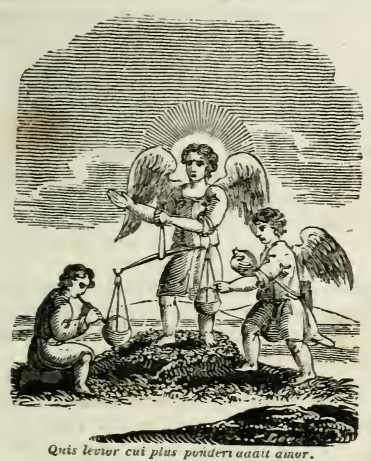
PSALM LXII. 9.

To be laid in the balance, it is altogether lighter than vanity.