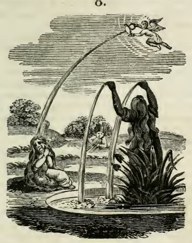
JER. IX. 1.

Oh that my head were waters, and mine eyes a fountain of tears, that I might weep day and night.