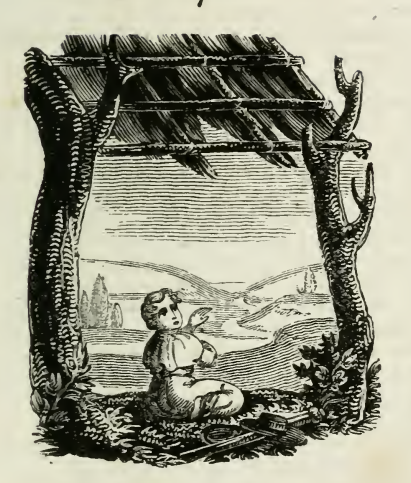
PSALM CXX. 5.

Woe is me, that I sojourn in Mesech, that I dwell in the tents of Kedar!