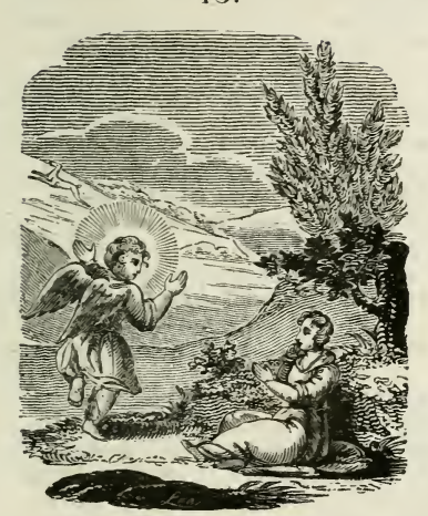
CANTICLES VIII. 14.

Make haste, my beloved, and be like the roe, or the young hart upon the mountains of spices.