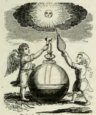
Sic lumine lumen ademptum.