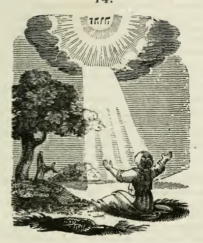
PSALM LXXXIV. 1.

How amiable are thy tabernacles, O Lord of Hosts!