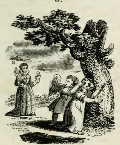
PSALM CXIX. 37.

Turn away mine eyes from beholding vanity. How like the threads of flax That touch the flame, are my inflam'd desires! How like to yielding wax,