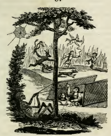
PSALM XVIII. 5.

The sorrows of hell compassed me about, and the snares of death prevented me.