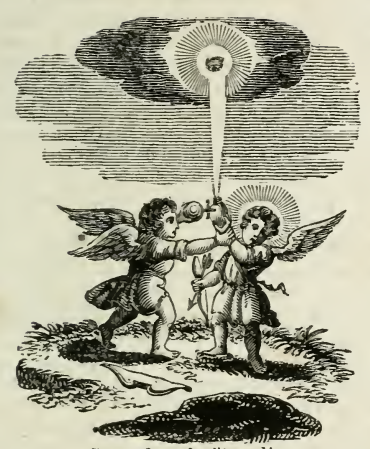
Putet athea ; clauditur orbi.