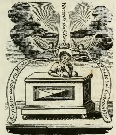
Fluesque coronat ad aras.