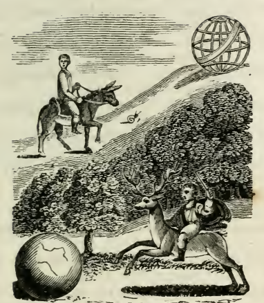
Da mihi frana timor : Da mihi calcar amor,