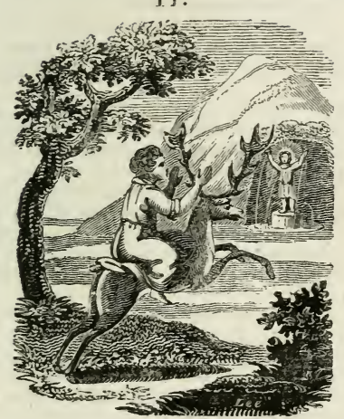
PSALM XLII. 1.

As the hart panteth after the water-brooks, so panteth my soul after thee, O God.