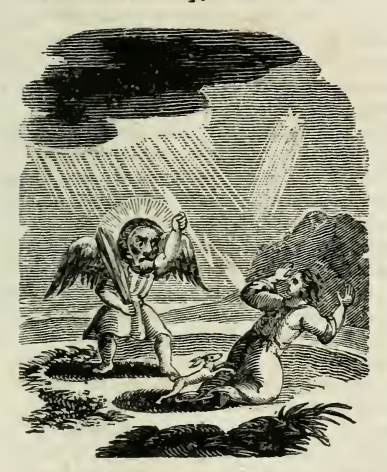
PSALM CXIX. 120.

My flesh trembleth for fear of thee; and I am afraid of thy judgments.