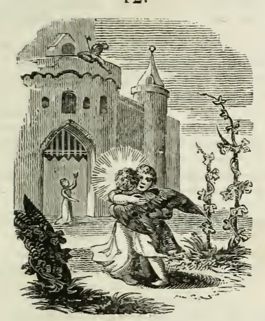
CANTICLES III. 3, 4.

Have you seen him whom my soul loveth? When I had past a little from them, then I found him; I took hold on him, and left him not.