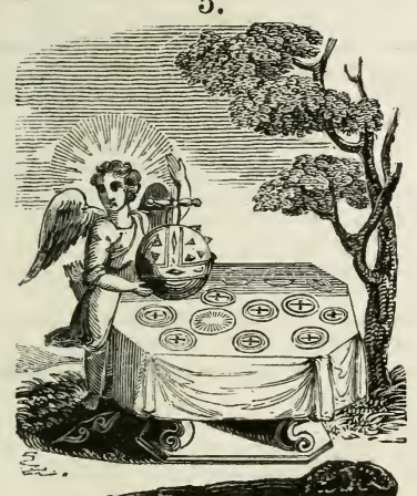
Non omne quod hic micat aurum est.