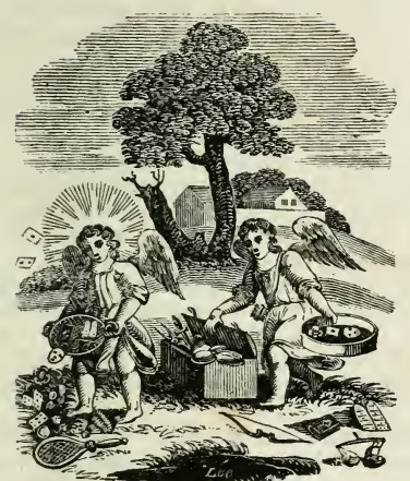
Hic pessima, hic optima servat.