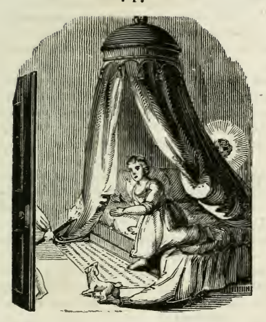
CANTICLES III. 2.

I will rise, and go about the city, and will seek him whom my soul loveth: I sought him, but I found him not.