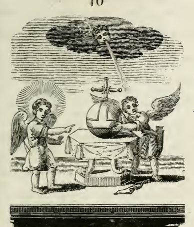
Tinnit; inane est.