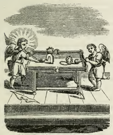
Erras hac itur ad illam.