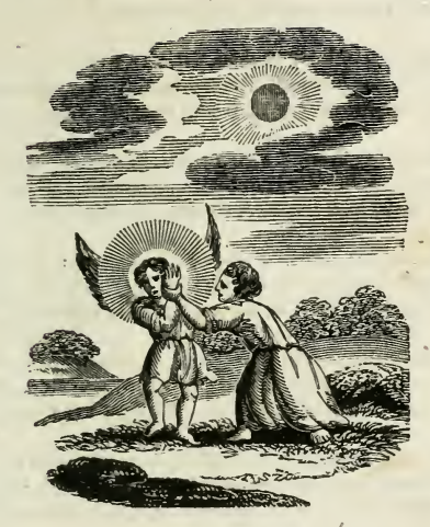
JOB XIII. 24.

Wherefore hidest thou thy face, and holdest me for thine enemy?