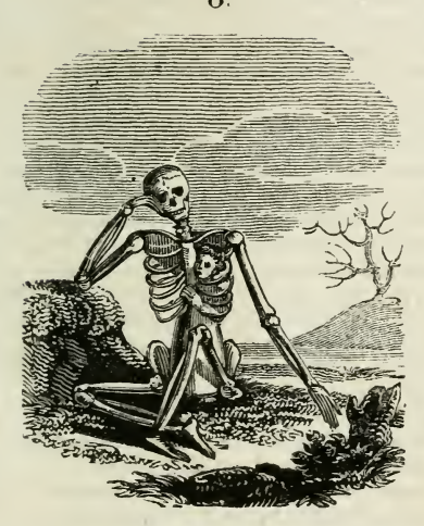
ROM. VII. 24.

O wretched man that I am! who shall deliver me from the body of this death?