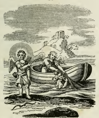
Non amat iste: sed hamat amor.