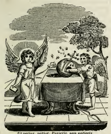
Ut potiar, patior, Patieris, non potieris.