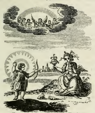
Hac animant pueros cymbala; at illa viros.