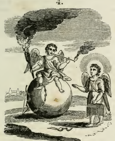
Quam grave servitium est quod levis esca parit.