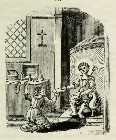
ESTHER VII. 3.

If I have found favour in thy sight, and if it please the king, let my life be given me at my petition.