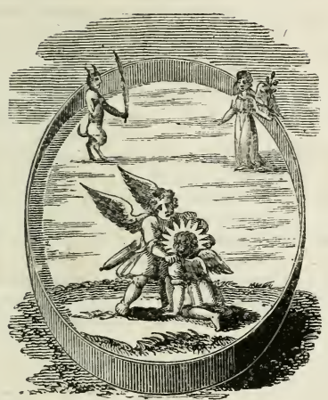
Post lapsum fortius esto.