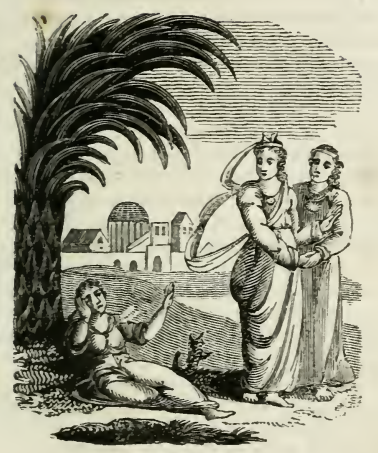
CANTICLES V. 8.

I charge you, O daughters of Jerusalem, if you find my beloved, that you tell him that I am sick of love.