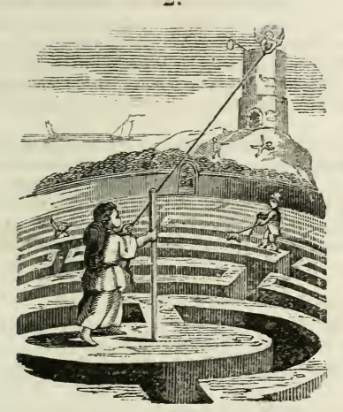
PSALM CXIX. 5.

O that my ways were directed to keep thy statutes!