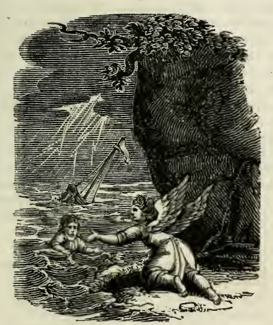
PSALM LXIX. 15.

Let not the water-flood overflow me, neither let the deep swallow me up.