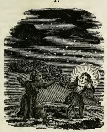
ISAIAH XXVI. 9.

My soul hath desired thee in the night. Good God! what horrid darkness doth surround My groping soul! how are my senses bound In utter shades, and muffled from the light, Lurk in the bosom of eternal night! The bold-fac'd lamp of Heav'n can set and rise; And with his morning glory fill the eyes