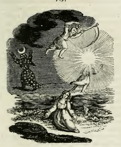
PSALM XXXI. 10.

My life is spent with grief, and my years with sighing.