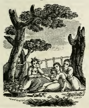
CANTICLES II. 5.

Stay me with flowers, and comfort me with apples, for I am sick of love.