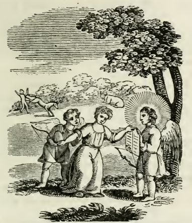
My soul hath coveted to desire thy judgments. Psalm cxix.