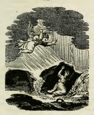
JOB XIV. 13.

O that thou wouldest hide me in the grave, that thou wouldest keep me in secret until thy wrath be past!