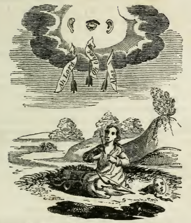
Lord, all my desire is before thee: and my groaning is not hid from thee. Psalm xxxviii. 9.