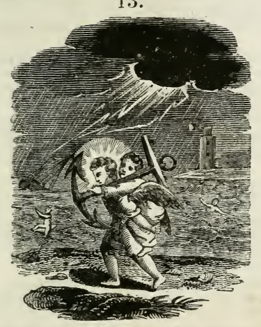
PSALM LXXIII. 28.

It is good for me to draw near to God; I have put my trust in the Lord God.