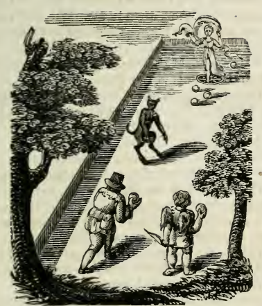
Utrinsque crepundia merces.