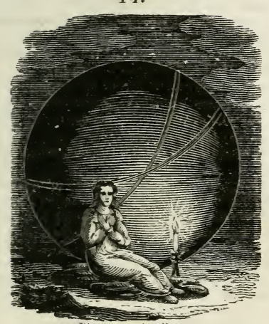
Phosphere redde diem.

Lighten mine eyes, O Lord, lest I sleep the sleep of death.