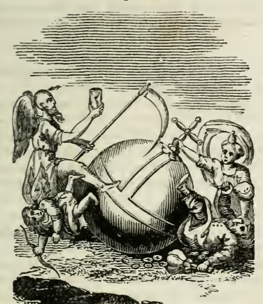
Frustra quis stabilem figat in orbe gradum.