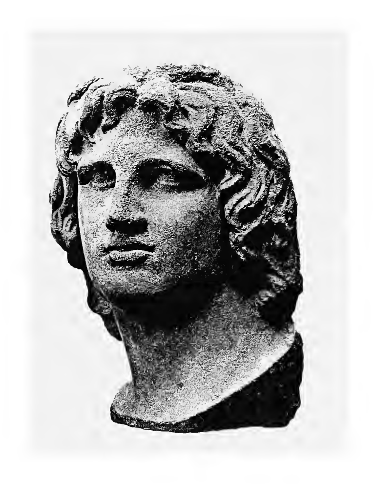
ALEXANDER THE GREAT B C 354-322