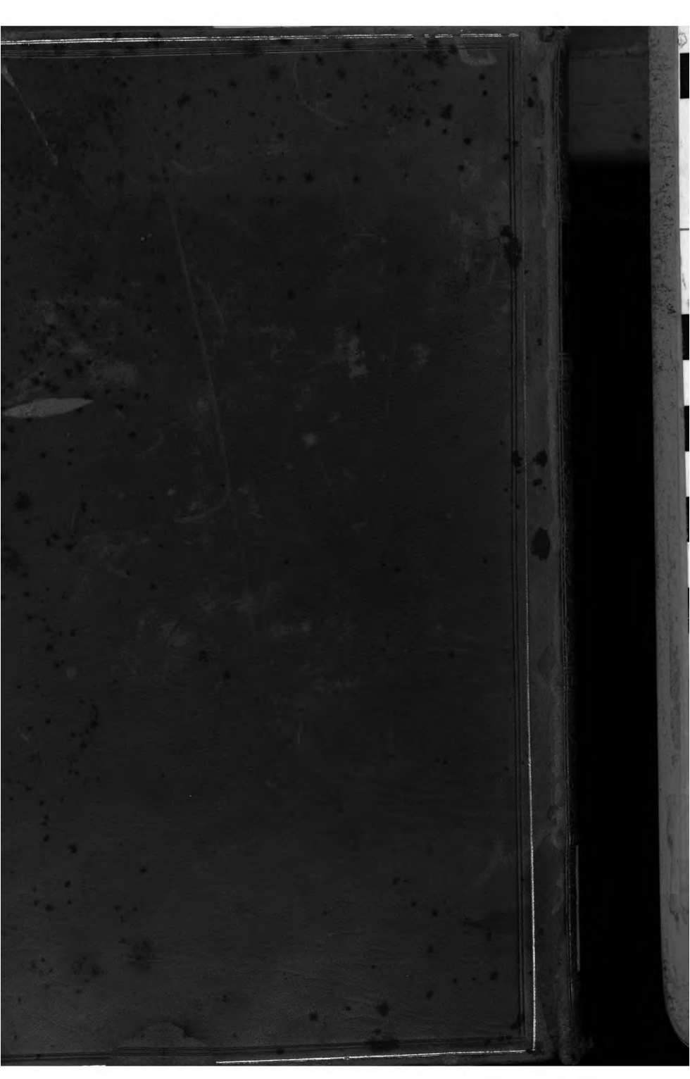
Digitized by Google