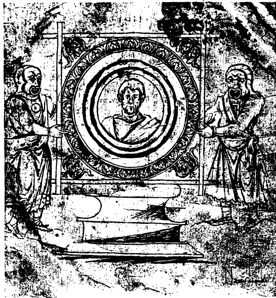
TERENCE. FROM A CAROLINGIAN MANUSCRIPT IN THE BIBLIOTHÈQUE NATIONALE, PARIS.