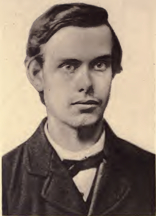
Francis Thompson in 1877