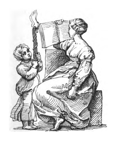
LONDON: EDWARD MOXON, DOVER STREET. 1839.