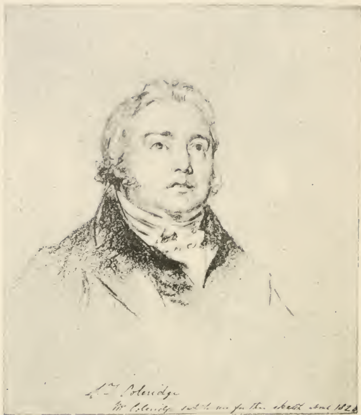
Samuel Taylor Coleridge from a drawing by C. R. Leslie R. A.