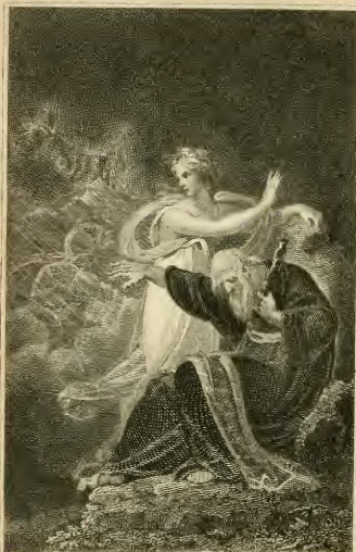
Grey, at his mossy cave, is bent the aged form of Clonmel. . . . . Panora page 473