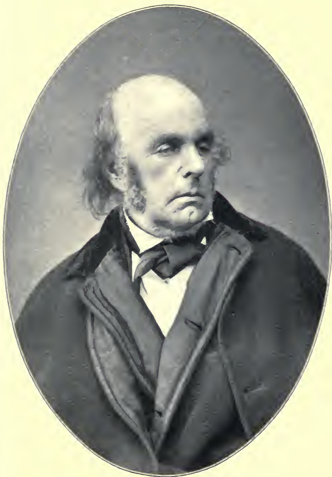
EDWARD FITZGERALD, 1883