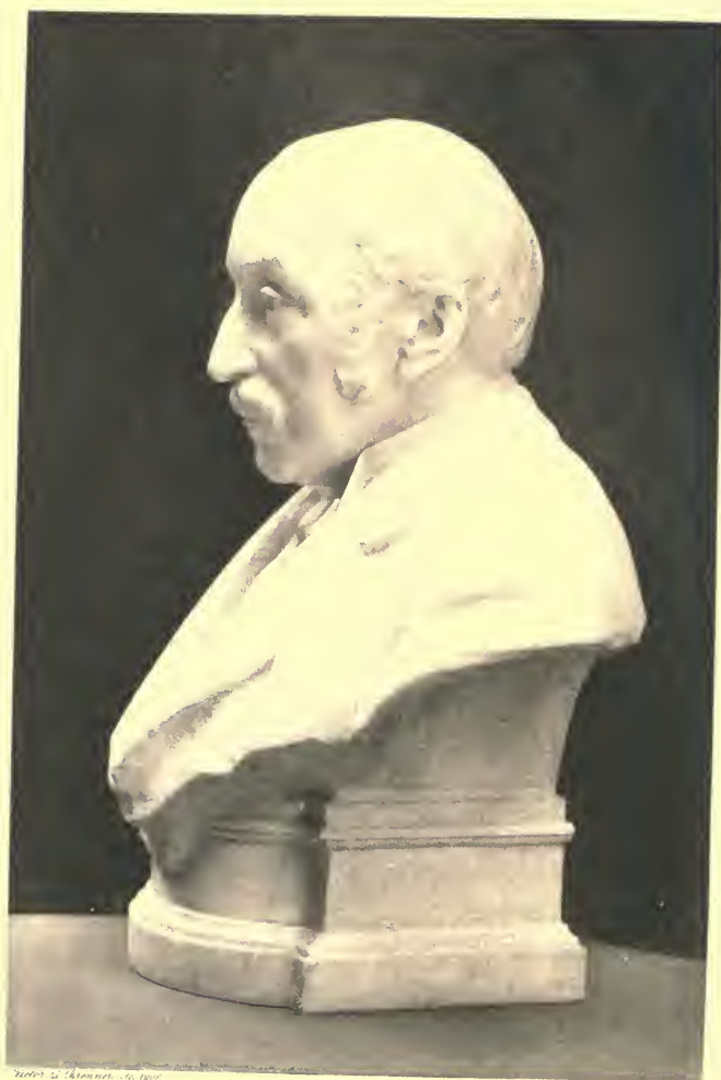
Victor Schœlcher. 1860.