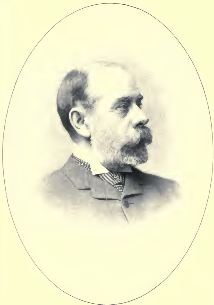
E. L. GODKIN, 1889