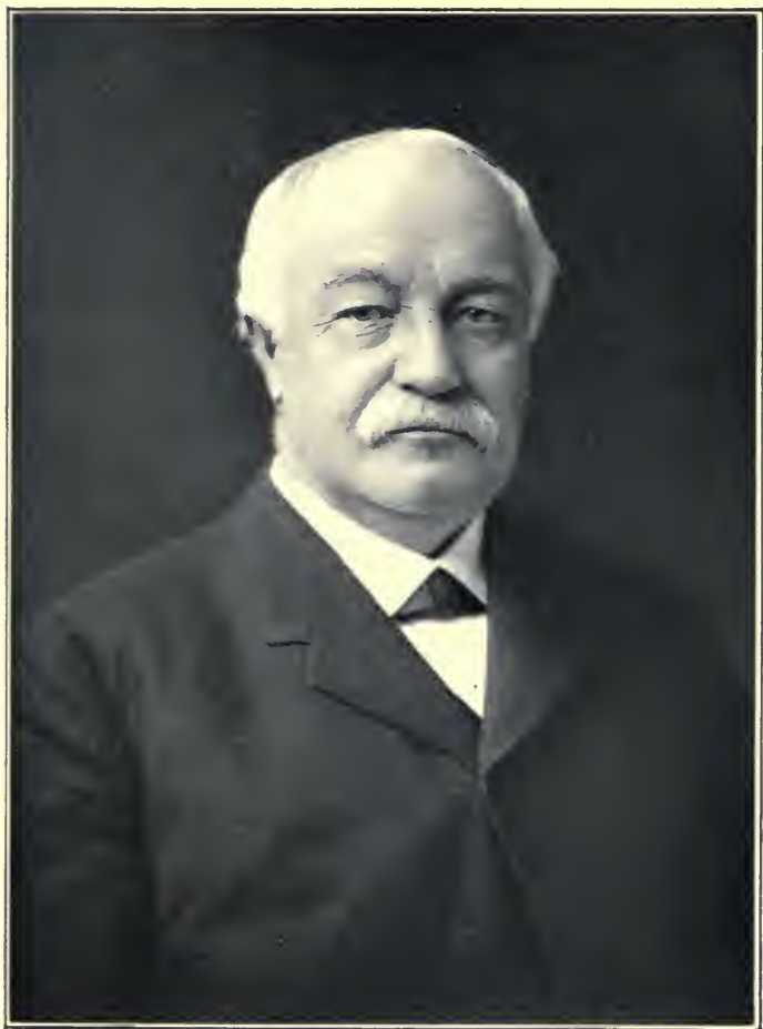
HORACE H. FURNESS