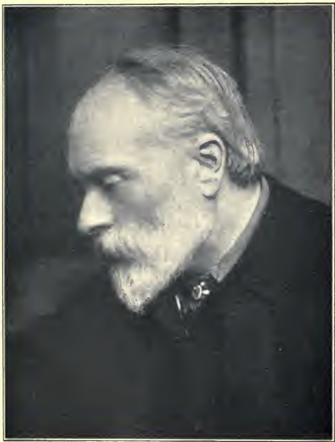
SIR EDWARD BURNE-JONES