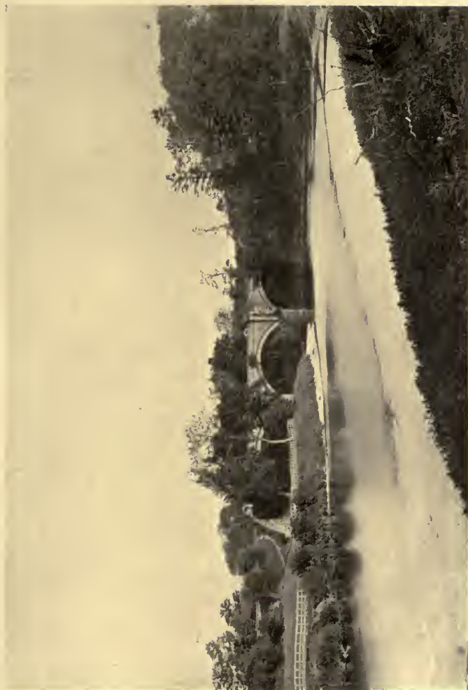
THE RIVER NITH AND AULDGIRTH BRIDGE