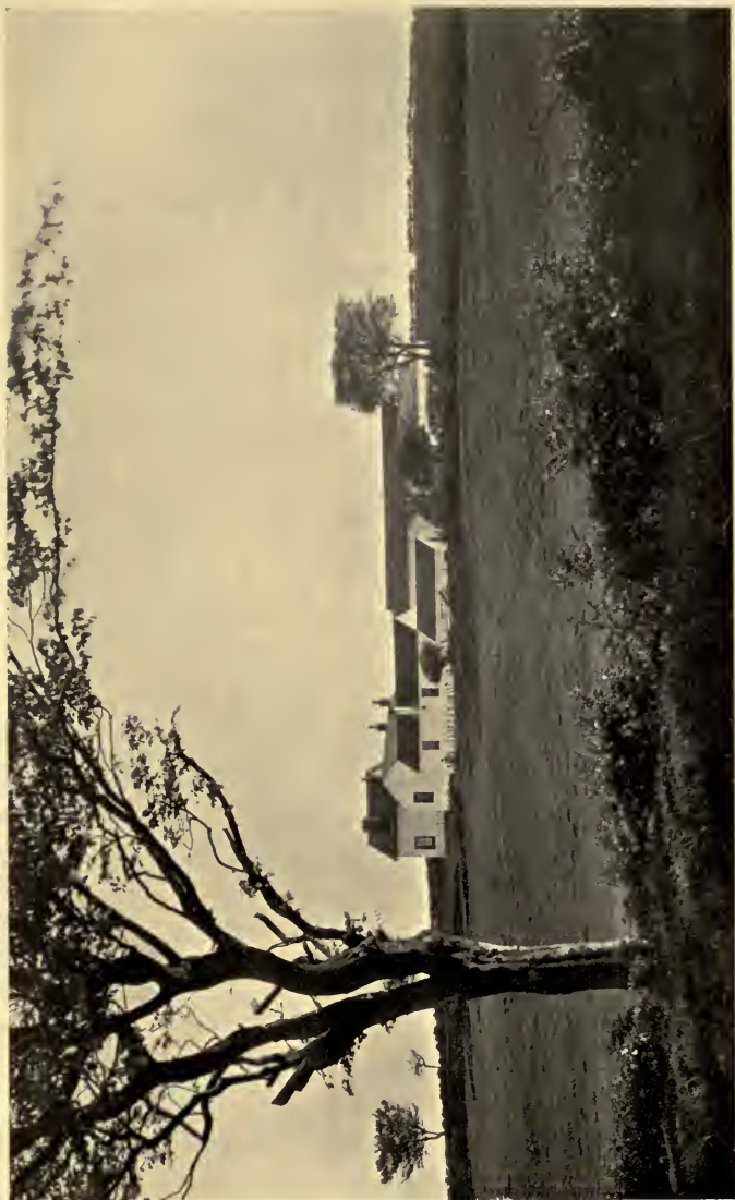
MAINHILL (DISTANT VIEW)