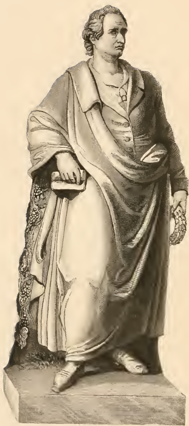
Goethe from the statue at Frankfurt