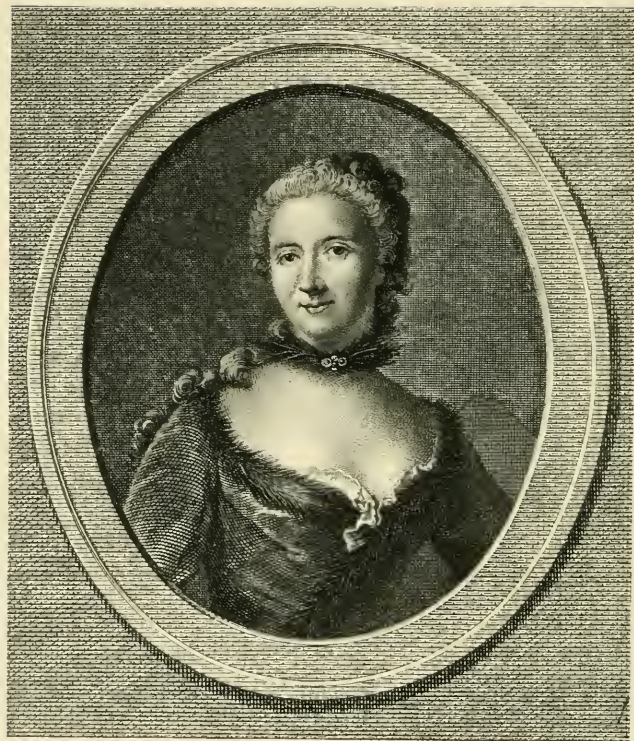
Madame du Châtelet