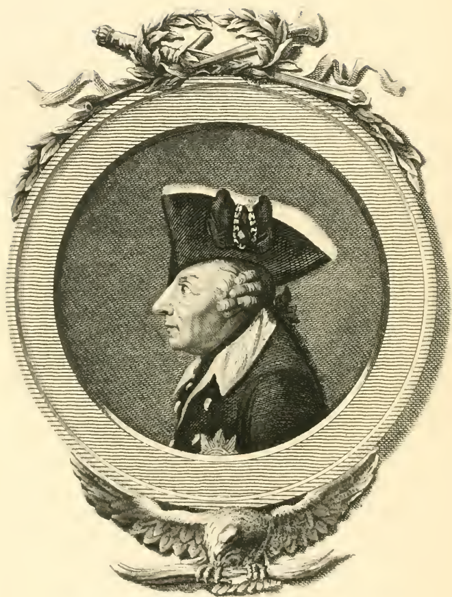
Frederick the Great.