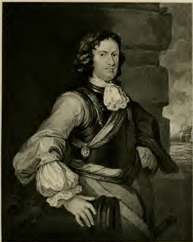
Colonel Montague. Earl of Sandwich.