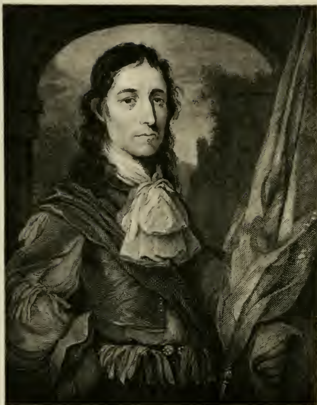
Sir Thomas Fairfax