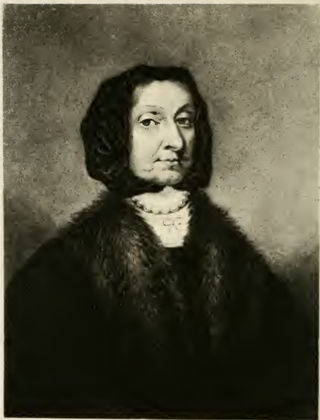
Elizabeth Stewart, Mother of Oliver Cromwell.