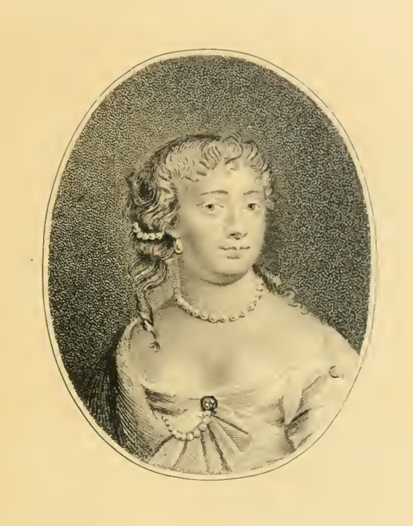
TY THY DE, DECHESSOR