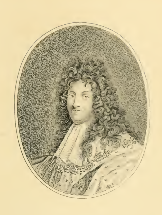
TOTAS THE POTATE