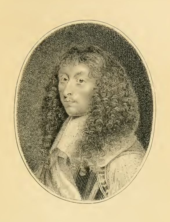
PRINCE DE CONDES