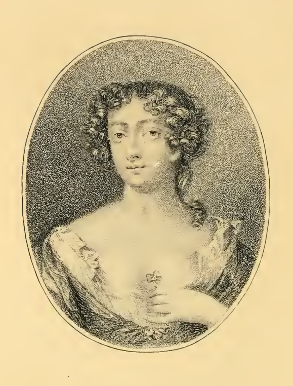
DUTIESS OF CLEVELAND.