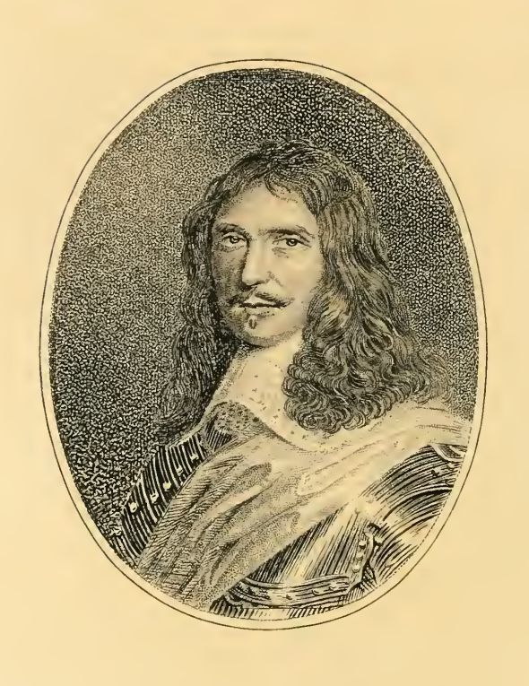
MARESCHAL DE TURESSE.