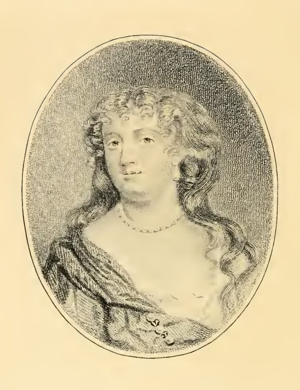
COUNTESS OF SHREWSBURY