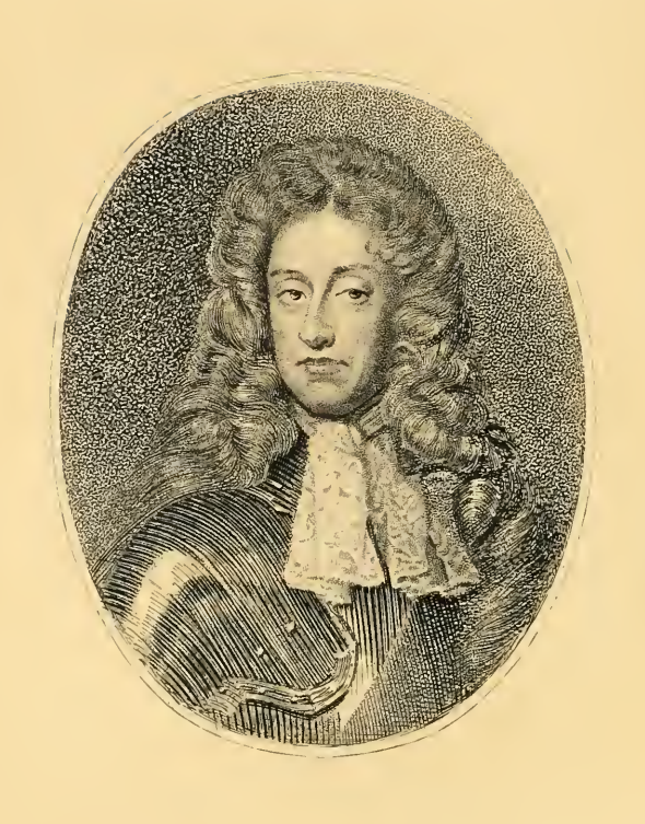
MANIES DUKE OF YORK.