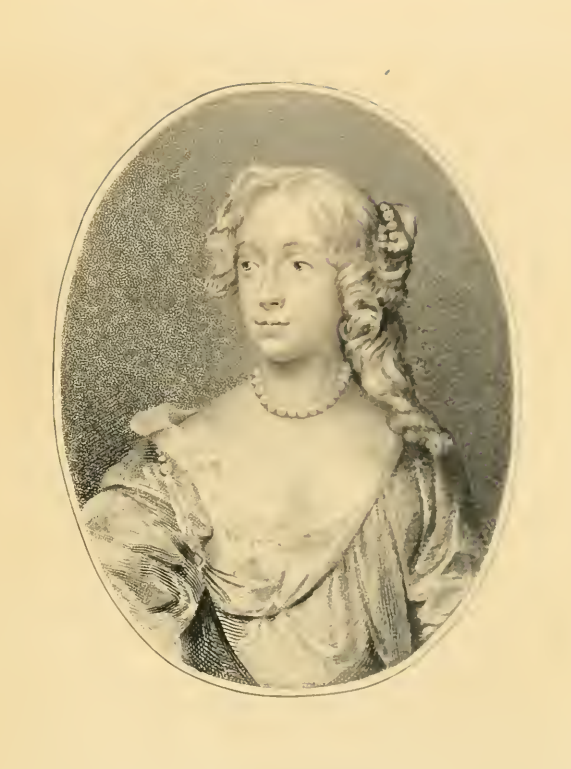
COUNTESS OF THESTED