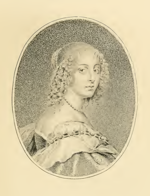
11 (12 " P.S.S ... ) . (3 1 =