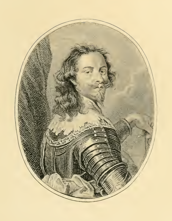
PRINCE D'AMME TO STORY