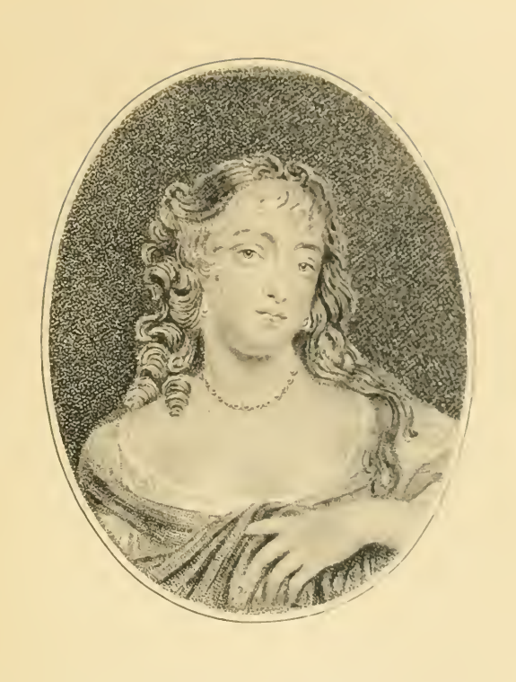
MISS 1 LOUKS after was a light of the Highlight