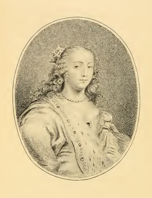
DUCHESS OF MEWCYSLIE