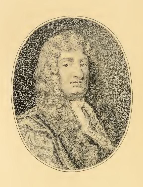
LORD WILLIAM RUSSEL.