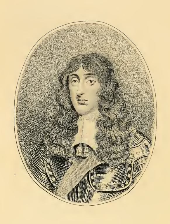
DYKE OF GLOCESTER.