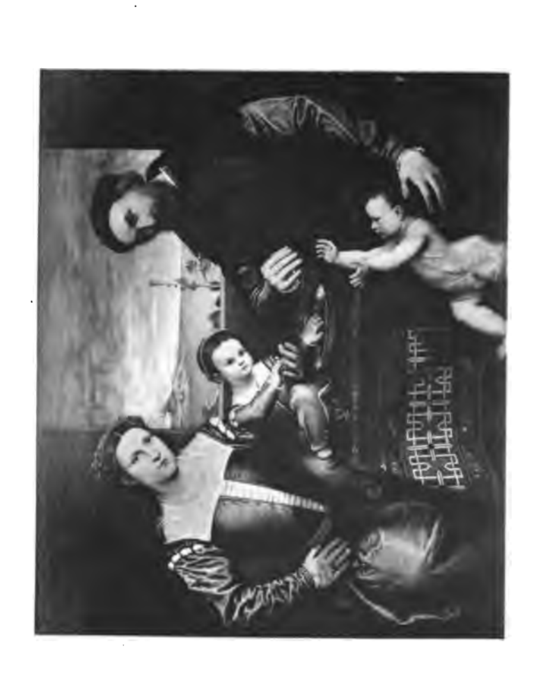
LOTTO: "TAMILY GROUP." - THE NATIONAL GALLERY, CENTER.