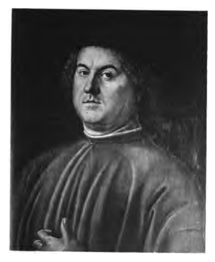
Alvise: PORTRAIT. - BONOMI - CERTON CHILLETION, MILLIA.