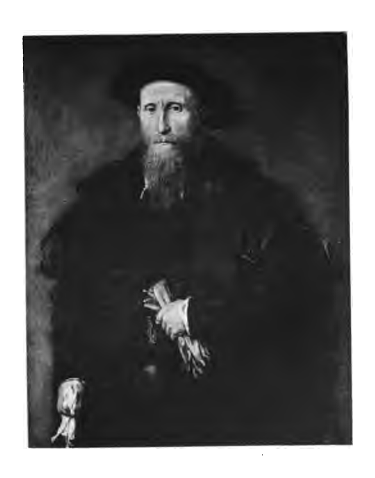
LOTTO: PORTRAIT OF CId MAN. - The BRERA, MILAN.