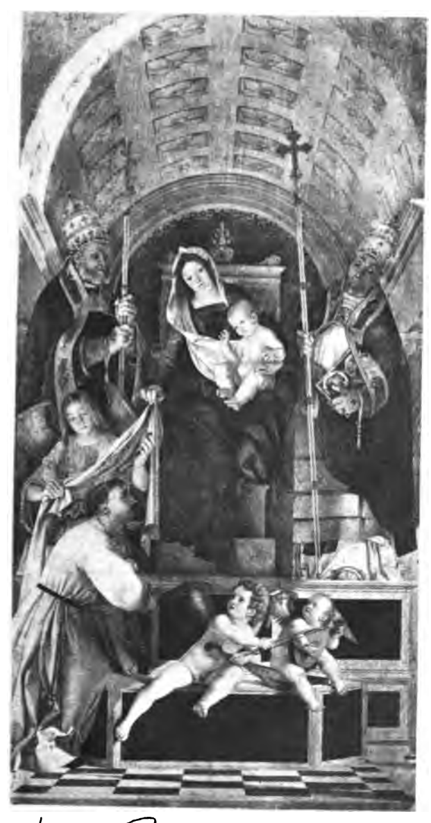
LOTTO: RECARATI AltAR- DIRAE.