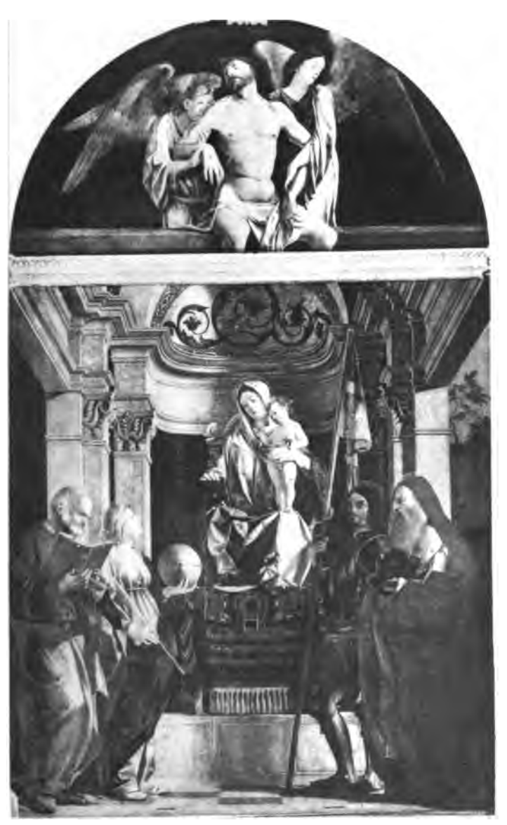
LOTTO: SANTA CRISTINA AltAR- MICE.