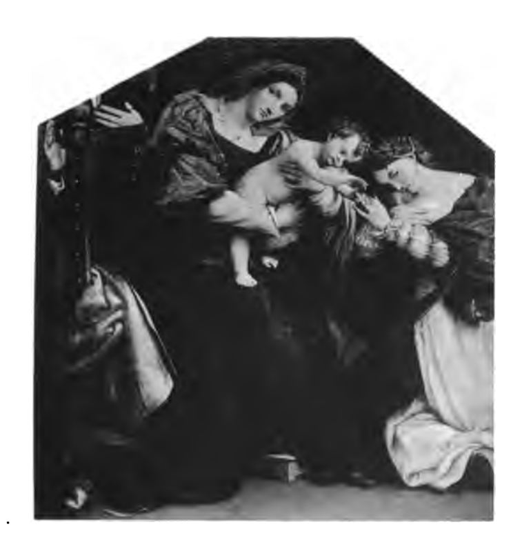
LOTTO: DETAIL FROM "HIRRINGL CF St. CATHERINE." - CARRARA GALLERY, BIRGAMO,