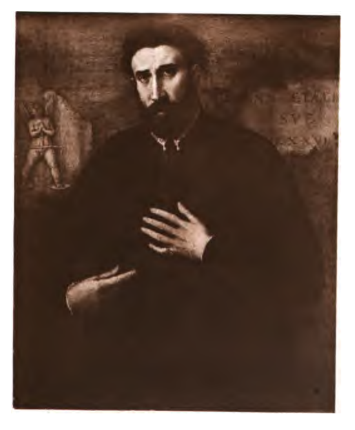
LOTTO: PORTRAIT. - DORIA PALACE, ROME.