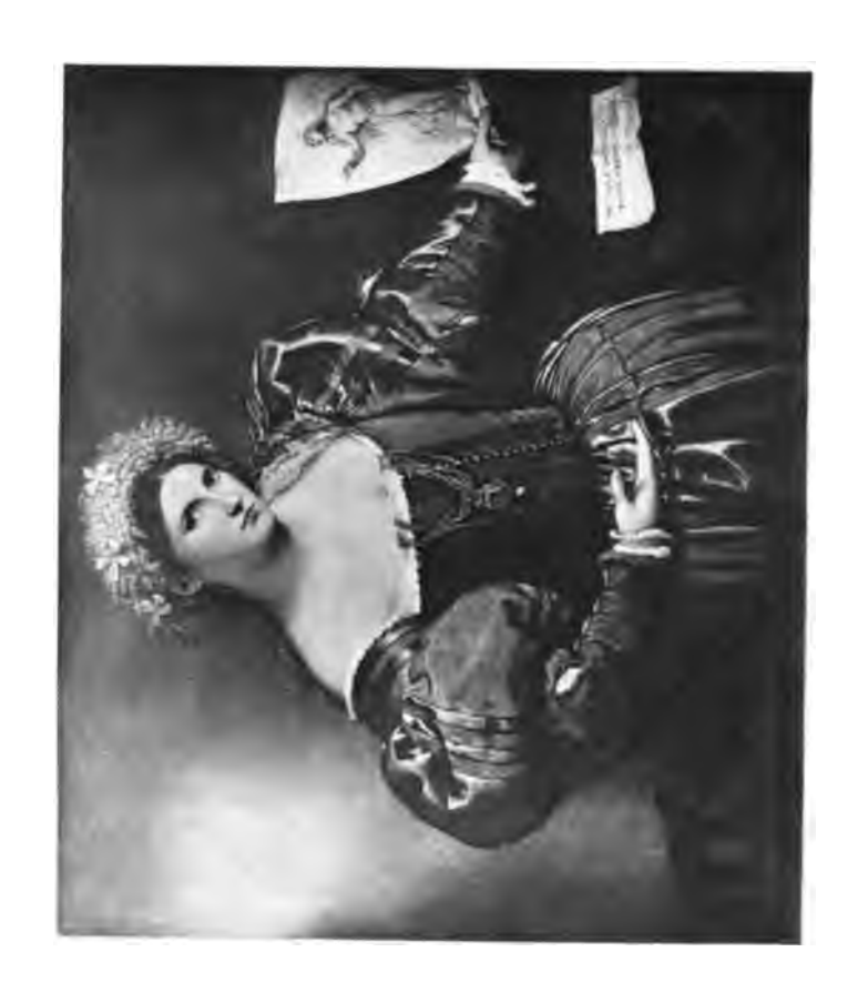
LOTTO: "The HOLFORD LUCRETIA." — DORCHESTER HOUSE, LONDOR.