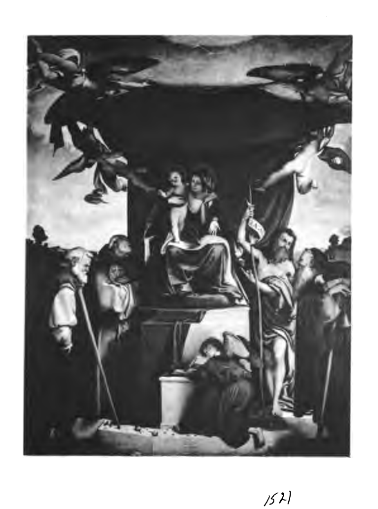
LOTTO: S. BERNARDINO AltAR- MICE. — BENARDING.