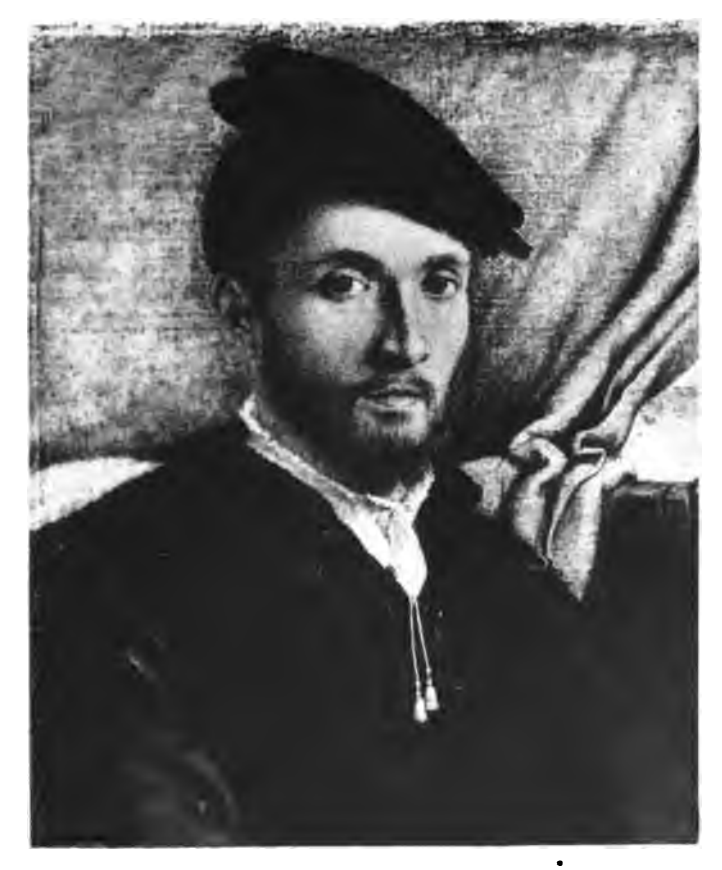
LOTTO: PORTRAIT. - BERLIN.