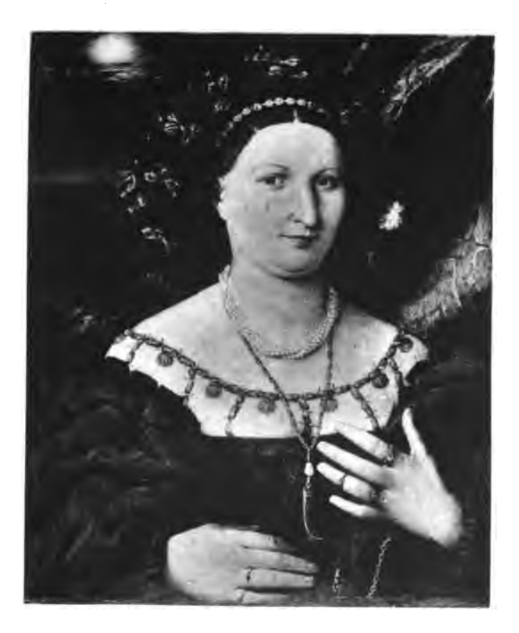
LOTTO: PERTRAIT OF A LAST. - CARRARA GALLERY, BIRGAMO.