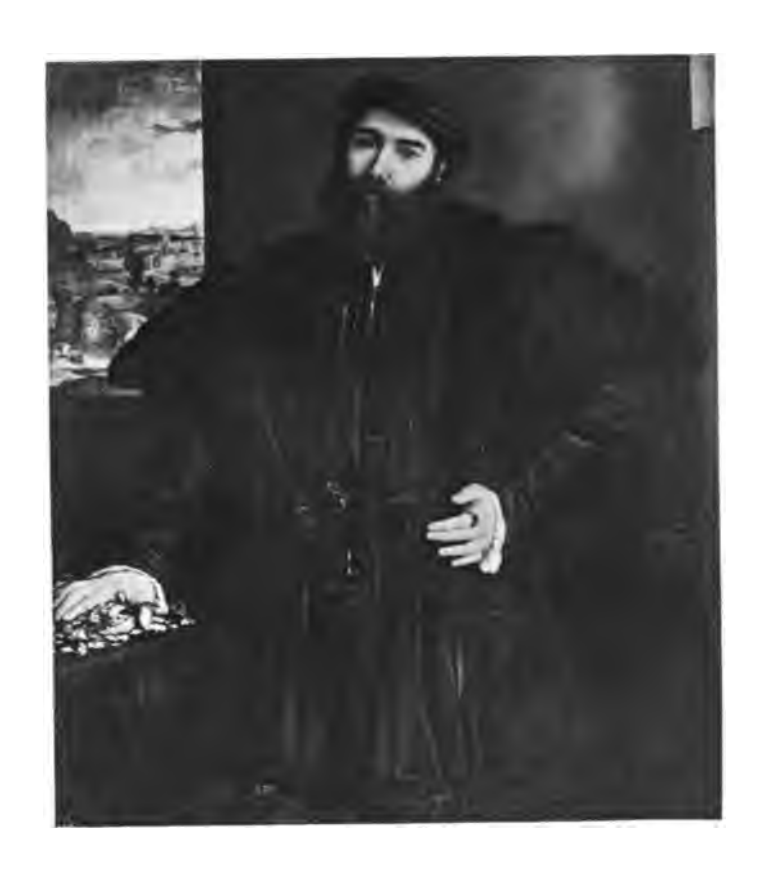
LOTTO: PONTRAIT. - VILLA BORGHISI, ROME.