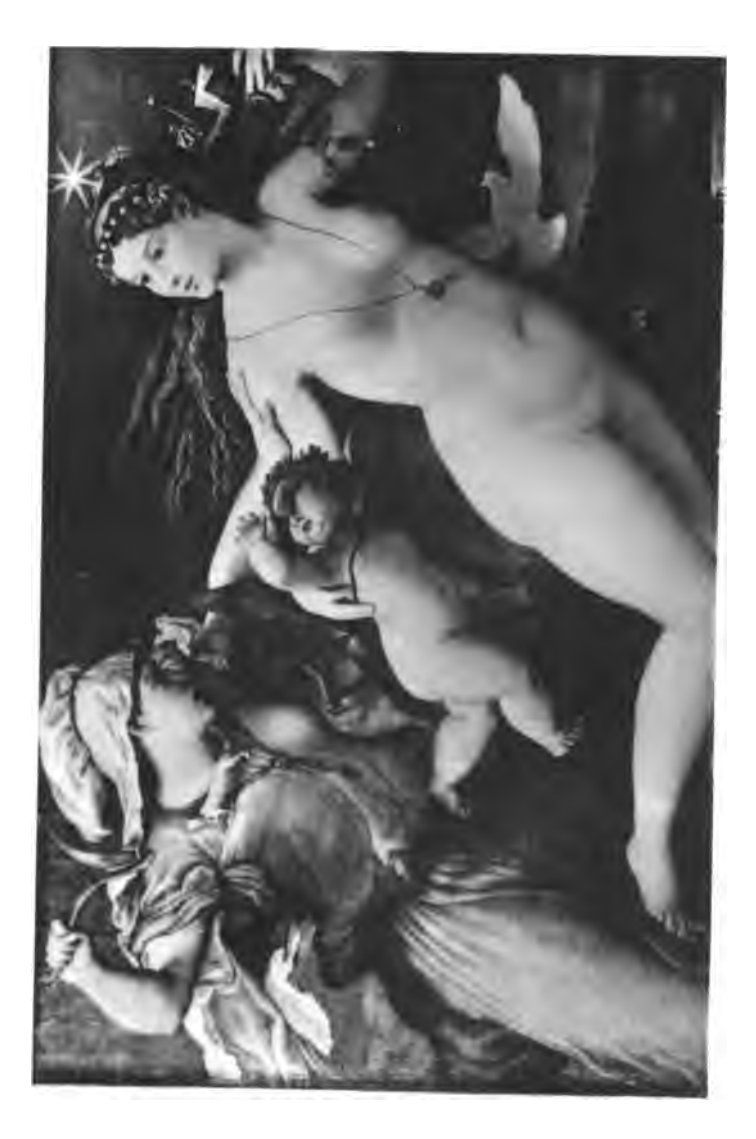
LOTTO: "TRIUMPH OF CHASTITY." - ROSPIGLIOSI GALLERY RIME.