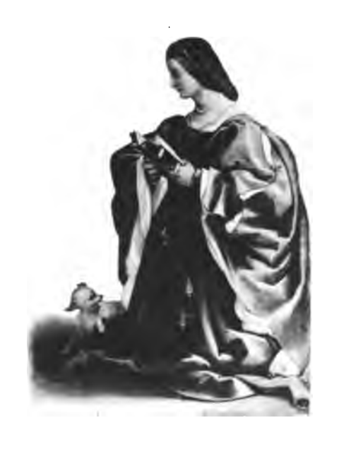
LOTTO: DONCR. FROM "CHRIST TAKING LEAVE OF His MITHER." - BIKIN.