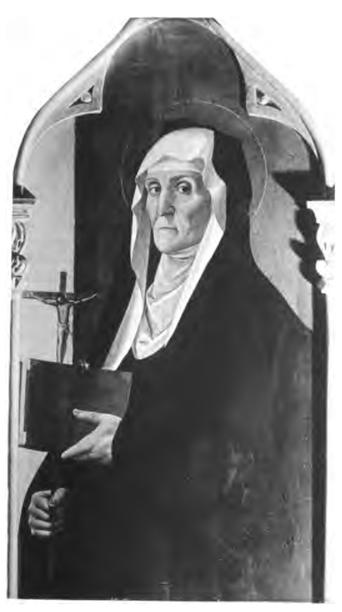
Alvise: St. Sinkl. - VENISL ACADEMY.