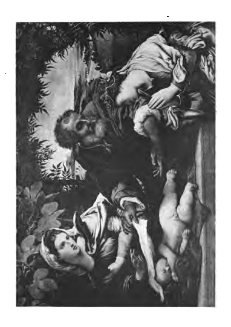
LOTTO: "Hely Family." — LOCHIS GALLIRY, BERGAME.