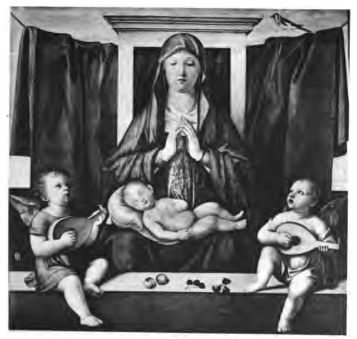
Alvise: " REDENTERE POLITICA. " - - VINICE.