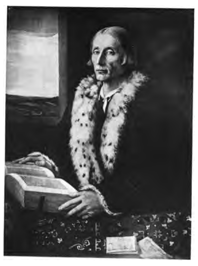
LOTTO: THE PROTHONOTARY GILLIANS. - THE NATIONAL GILLERY, LONDING.