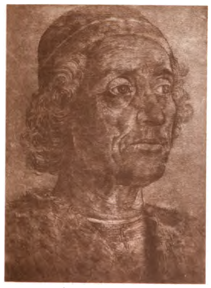
Alvise: DARWING TOR PORTRAIT.