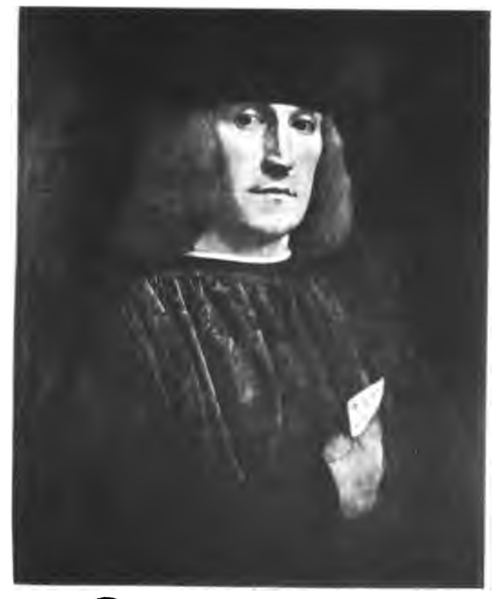
Alvise: PERTRAIT OF ELKNARTO GI CILLA. — THE LOUVER.