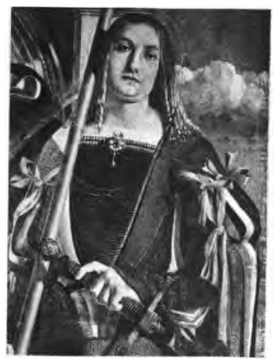
LOTTO: S. VITO. FROM the AHAR- PIECE AT RECANATIO