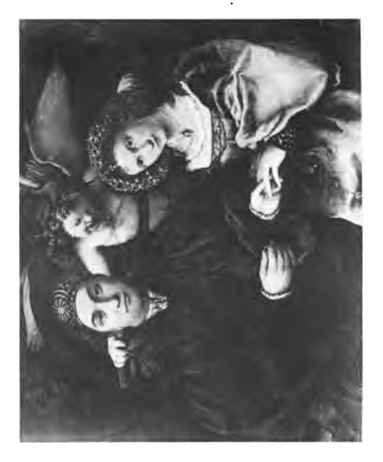
LOTTO: " THE BRIDAL CUPLE." - PHILEID.