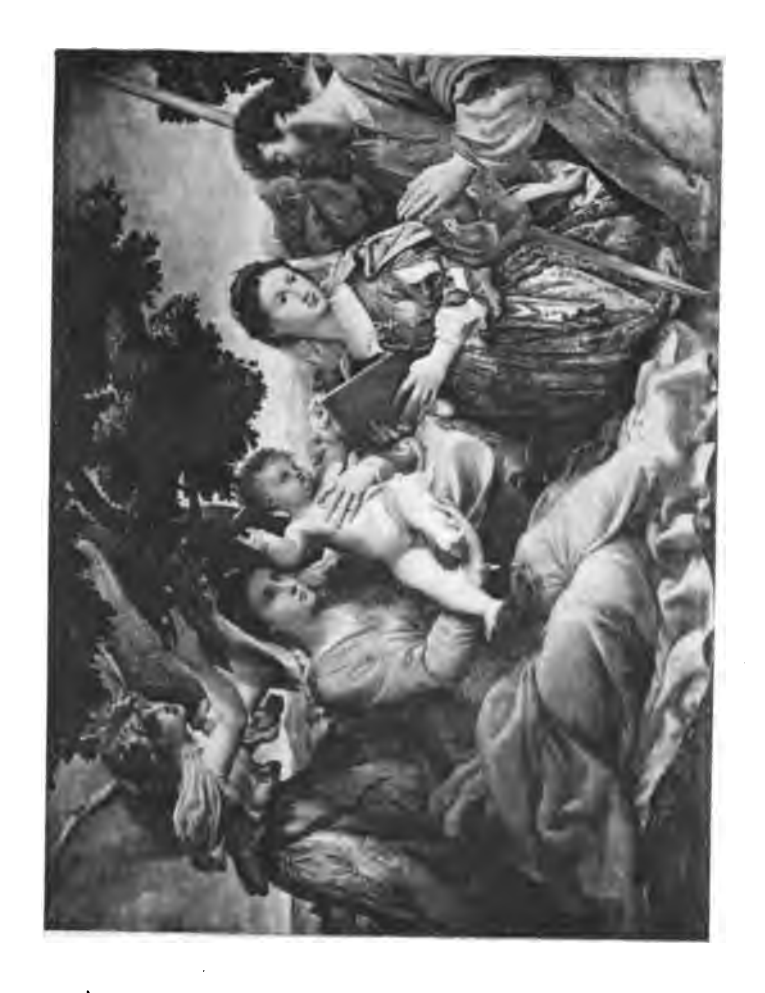
LOTTO: " SANTA CONVERSAZIONE." - VINNA.